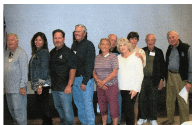
Yacht Club Officers 2018