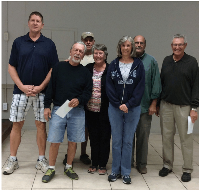
Harbour Heights Civic Association Board of Directors for 2018 elected Jan 18, 2018