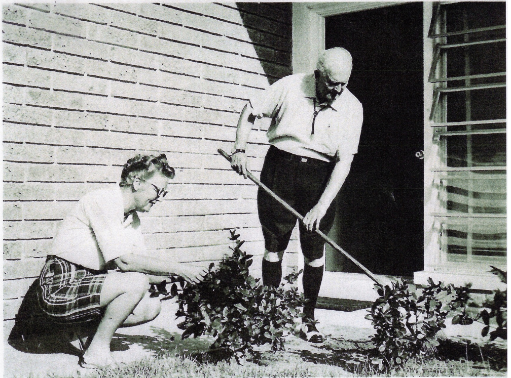
Everyone has a "green thumb" at Harbour Heights where beautiful flowers and shrubs are grown, with ease, in the rich Florida soil and

Coming from the hustle and bustle of urban living it is easy for people to adjust to the slower, more relaxed pace at which things are done in Florida. Once you settle in, a feeling of peace and security manifests itself, and you find yourself able to do just what you wish to — and at your own pace.